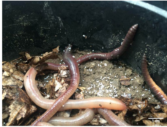
Figure 4. Polyethylene (PE-I; 710–850 \mu\text{m} ) microplastic particles adhering to the skin of two earthworms. Picture taken during the harvest of the experiment.

Earthworms are not the only soil biota producing biopores, for example also plant roots produce extensive biopores (e.g., ref. 16). This means that also other soil biota could be examined for the potential to enhance movement of microplastic down the soil profile. In addition to biopore-producing biota, other soil biota may also contribute to the vertical and horizontal movement. It is conceivable that termites, collembola, enchytraeids or nematodes move such particles in soil 13 , albeit likely at a smaller spatial scale than what we observed for earthworms in the short term. At a larger scale, animals such as gophers, moles, or voles may be important. In agroecosystems, where microplastic application is perhaps most likely, there additionally is the factor of ploughing, which would be expected to greatly contribute to incorporation of materials into the soil.