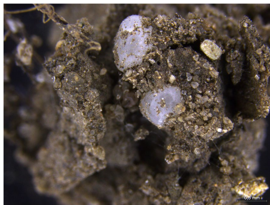
Figure 3. Polyethylene (PE-2; 1180–1400 \mu\text{m} ) microplastic particles incorporated into surface middens. Picture taken during the harvest of the experiment.

following passage through the gut (the latter is supported by the pervasive presence in droppings). To further support the ingestion/egestion mechanism, Huerta Lwanga et al. 12 have also documented the presence of PE microplastic particles (<150 \mu\text{m} size was used in their study) in earthworm egestate. Our study was not specifically designed to distinguish the relative importance of these transport mechanisms. Now that transport by earthworms has been shown, future studies should aim at disentangling these different transport pathways, also as a function of soil properties (in particular texture and structure) and amount of plastic material. For example, Huerta Lwanga et al. 15 , having compared different concentrations of PE microplastic (rather than sizes, as we have done), find concentration-dependent incorporation of microplastic material into burrow walls (data normalized to worm biomass). Additionally, it will be important to next design studies under field conditions to capture transfer rates under more realistic conditions.